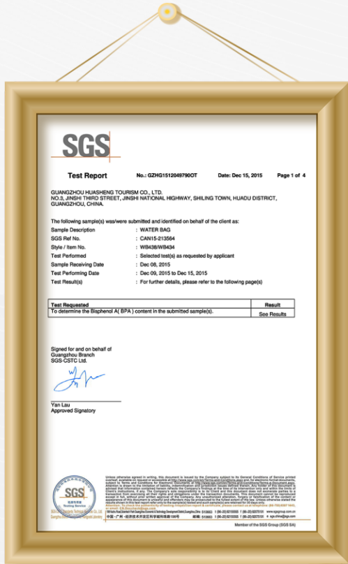
SGS Report Of Water Bladder